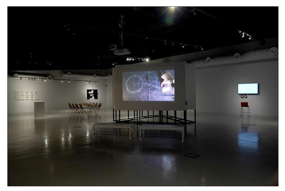
Figure 1: Between the Visible and the Invisible, Maraya Art Centre, Sharjah, 2018.

As a new form of being in the new land emerges, it becomes a stranger to the being that was there before, thus the loss of symbolic reference points – their surroundings and what lies ahead – all seem to hide in darkness and the unknown. This is perceived as a painful moment and the transformative being is, therefore,